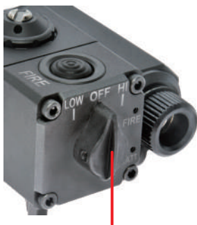
Power training mode selector knob

Dual-mode functionality includes a low-power eye safety training mode and a high-power operational mode.